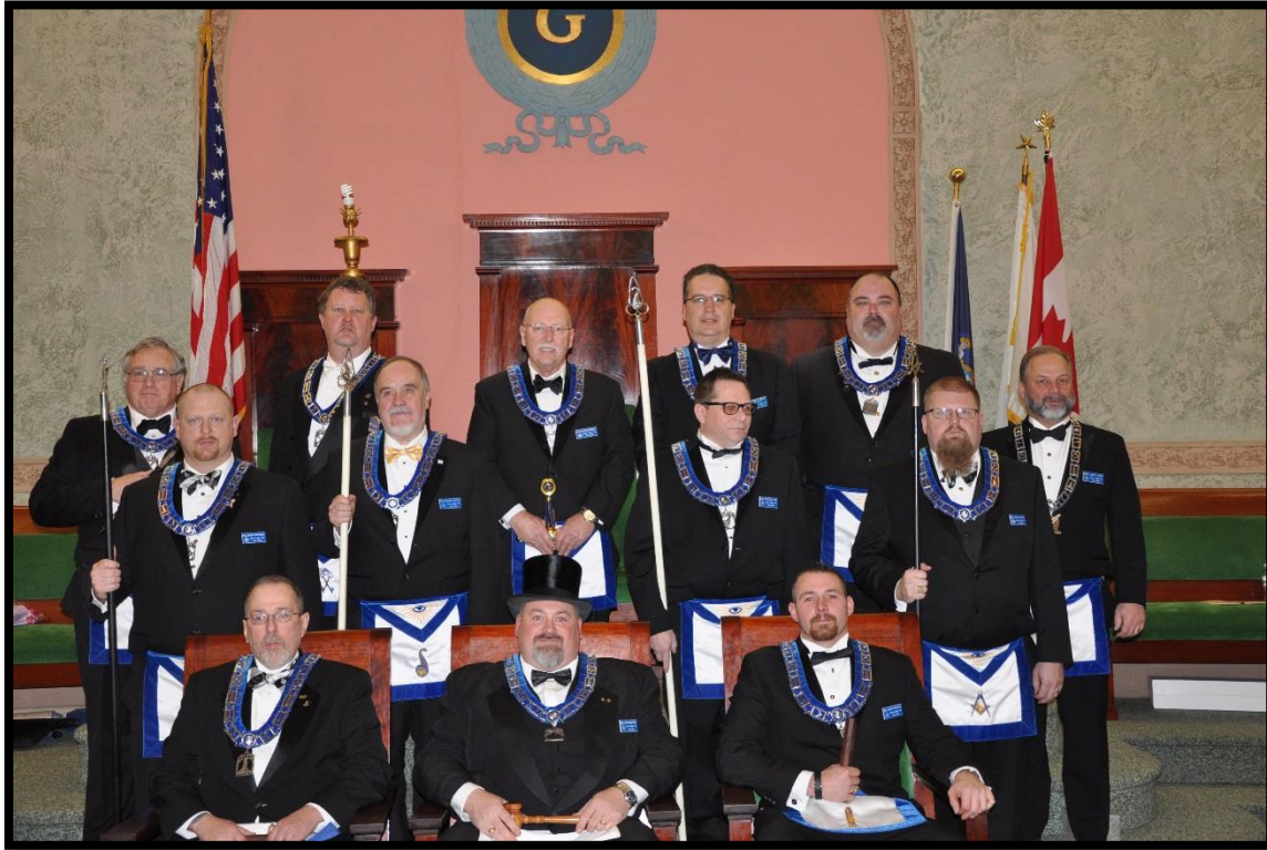
Officers of Saco Lodge 2016