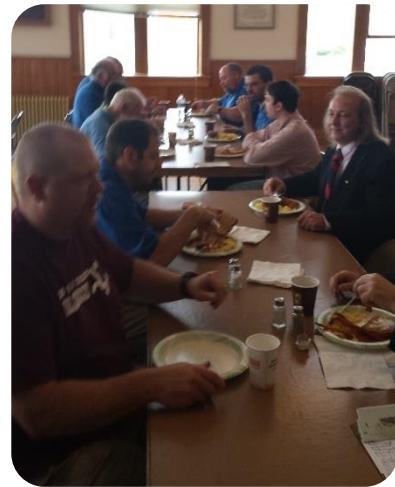
The brethren present for Square & Compass Day