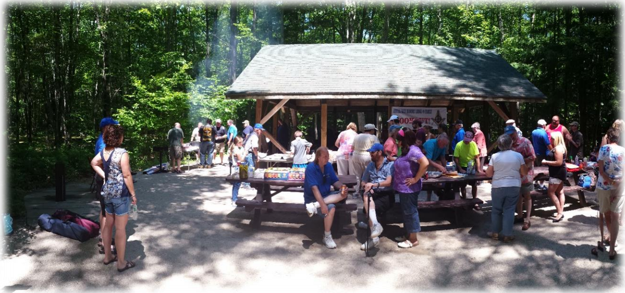
Families having fun!