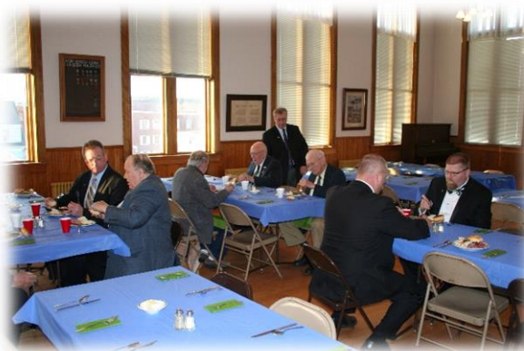
The PM's getting ready for the night!