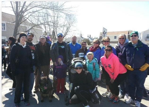
Officers of Saco Lodge Attending the 2014 Edition of Mary's Walk with their families and friends.