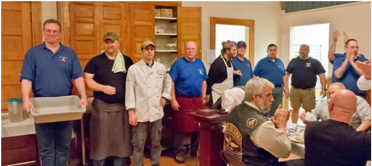
The rest of the crew