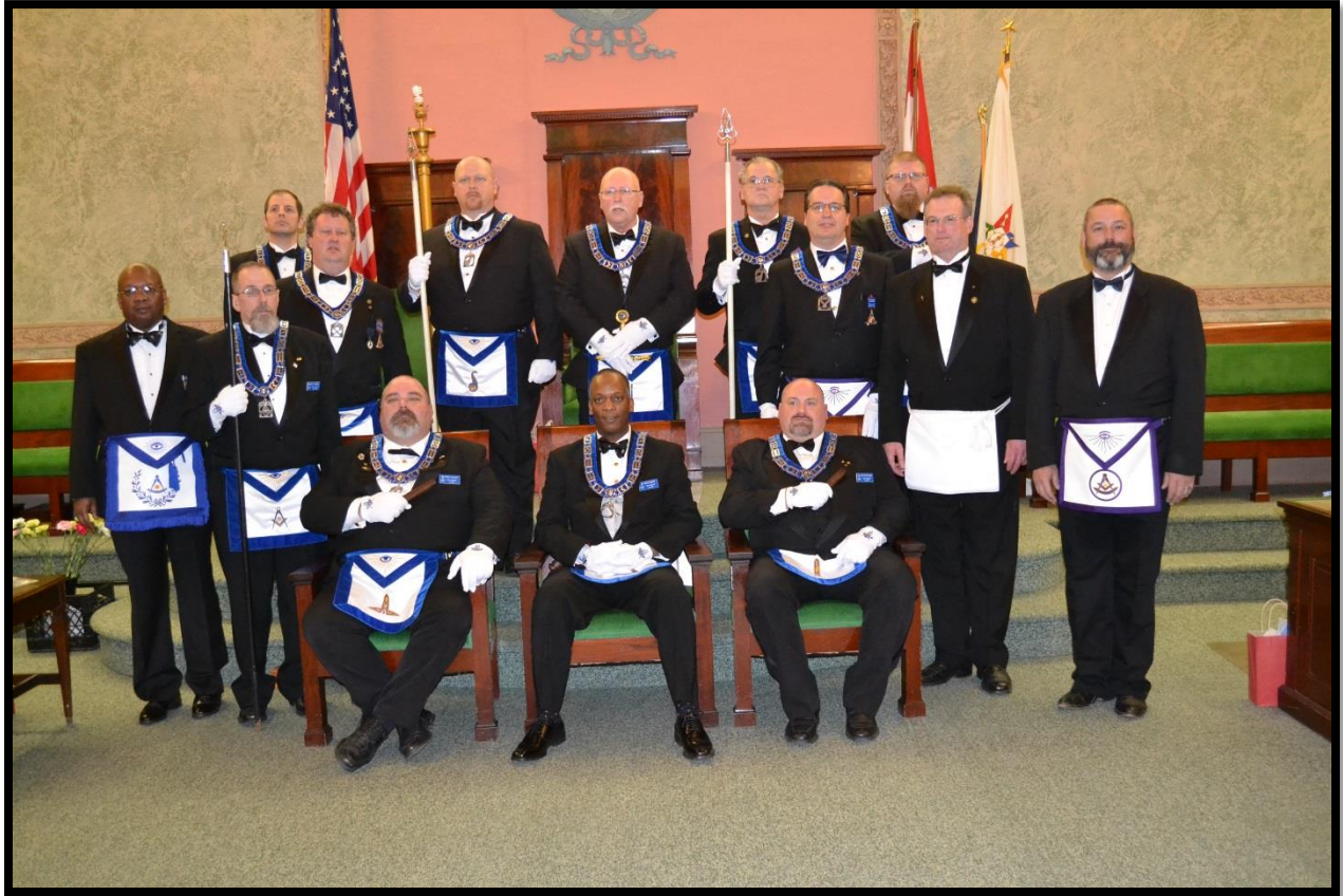
Officers of Saco Lodge 2014