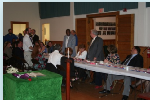
Veteran's standing for their toast