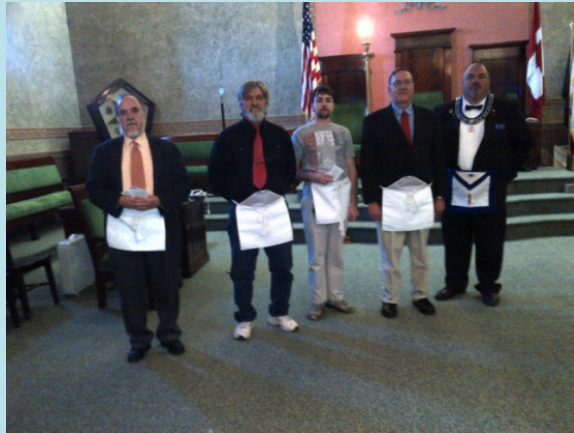
Masonic Open House, 2013

I need to thank the dedicated Membership committee of Saco Lodge, the Officers, Past Officers and Brethren that helped make the Open House day a true success. Our day started early, at 7:30 we opened the Lodge and performed four Entered Apprentice degrees, followed by the Open House portion of the day where we had several interested men stop in for information on joining our ranks. Pizza was served, and many of us were there to meet and talk to prospective candidates. We still have four more Entered Apprentice Degrees to do, which we will be performing on the 19 th of November.