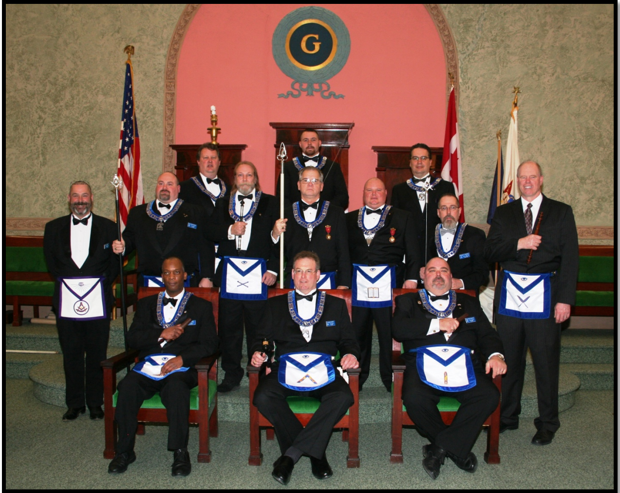
Officers of Saco Lodge 2013