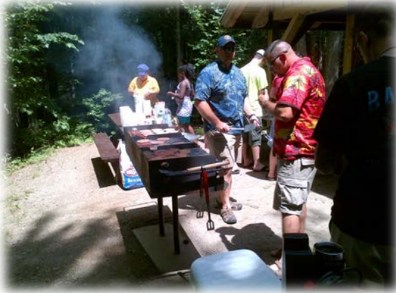
Additional Scenes from the First Annual Picnic