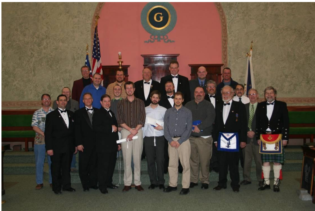
The brethren who attended that night.