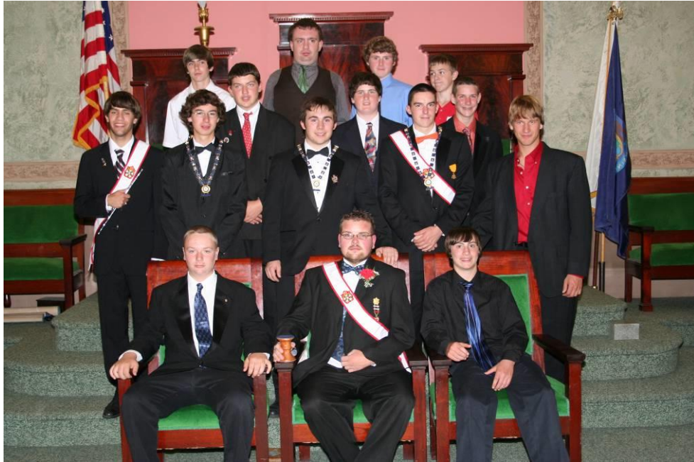
The Officers of Valley Chapter - Before.