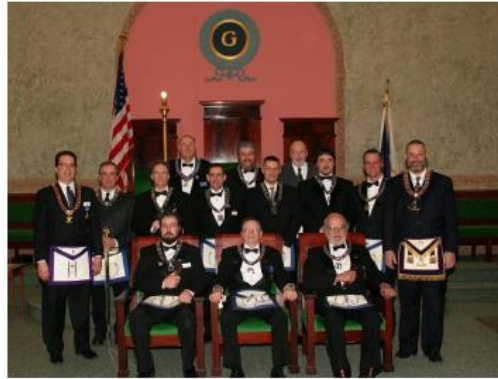
SACO LODGE #9 F. & A., M.