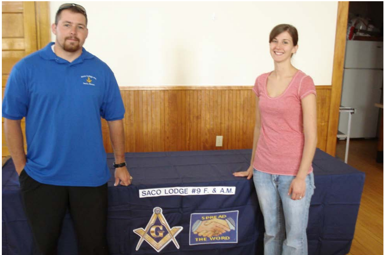
The serving table is ready!