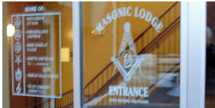
Rear entry door sign