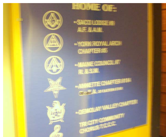
Lodge entrance door