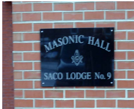
Back door facing parking lot