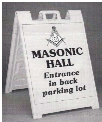
Front Door Sign