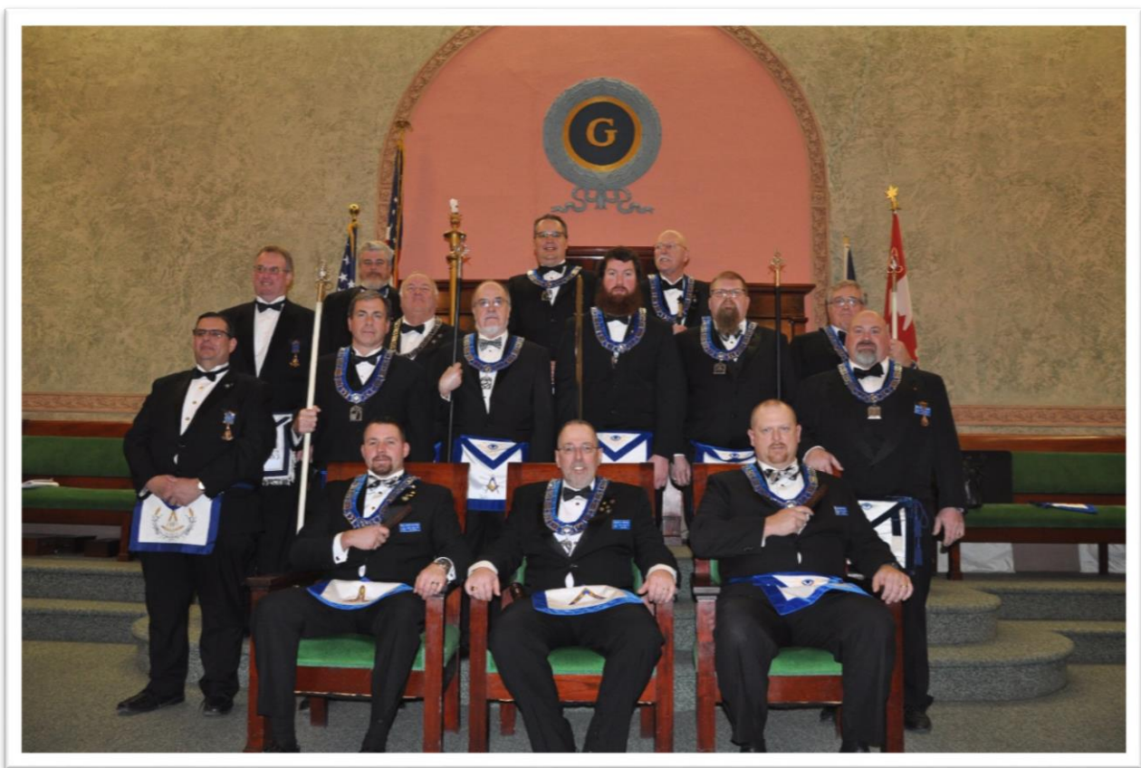
Officers Installed for 2017